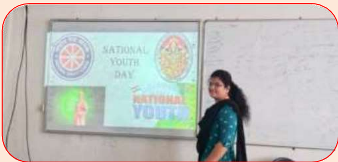
National Youth Day (12-01-2023)