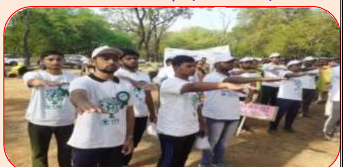
World Environmental Day (5-6-2023)