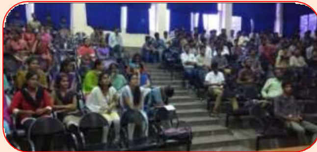
World Health Day (7-4-2023)