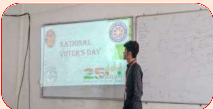
National Voters Day (25-1-2023)