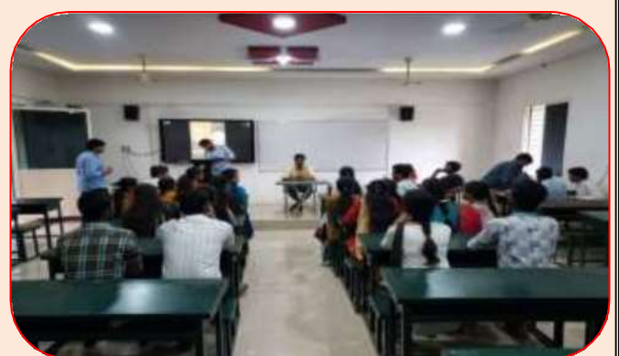
Central Excise Day (24-02-2023)