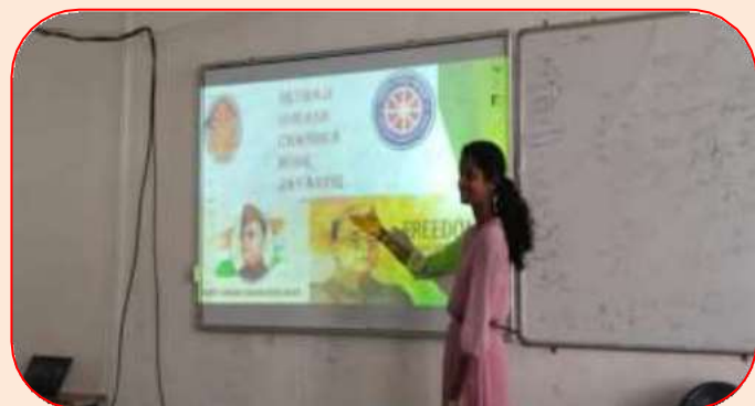
Netaji Subhas Chandra Bose Jayanti(23-1-2023)