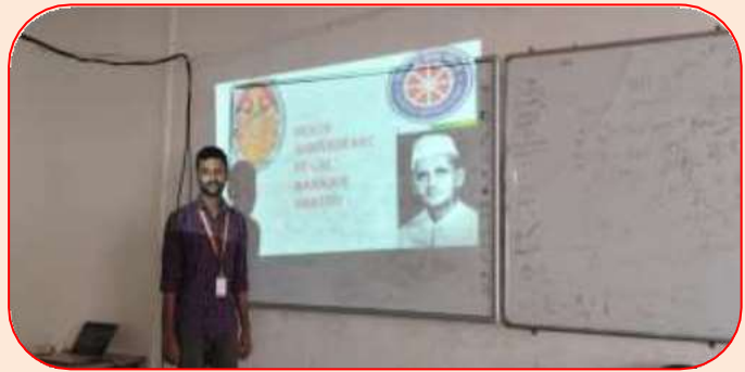
Death anniversary of Lal Bahadur Shastri(11-01-2023)