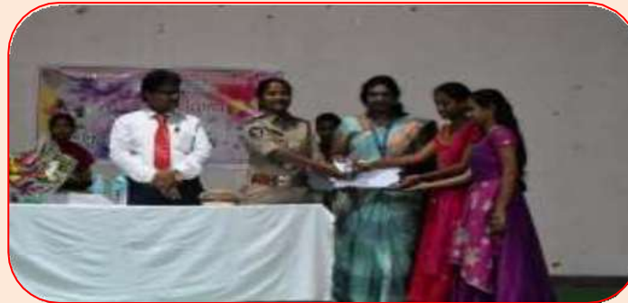
SANKRANTHI SAMBARALU-2023 (13-01-2023)