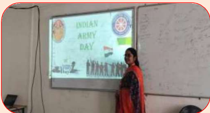
Indian army Day (19-1-2023)