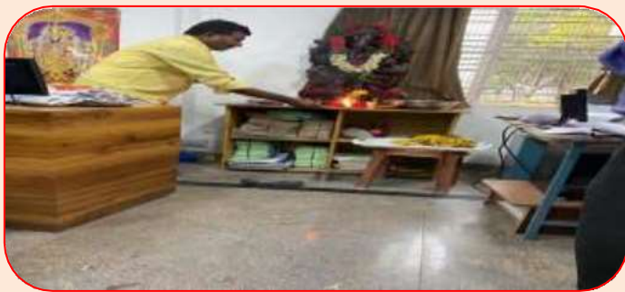
Ugadi Festival Celebrations (22-3-2023)