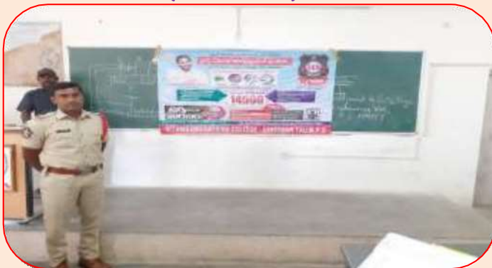
AP towards anti drugs (13-02-2023)