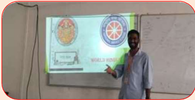
World Hindi Day (10-01-2023)

Our students as NSS Volunteers continuously showing leadership skills and serving rigorously for community health care, literacy drives, environmental protection, Blood donation camps, informative lecture on human values regularly to the society by visiting nearby villages and educating and helping the poor and the destitute. This time NSS has also organized many activities.