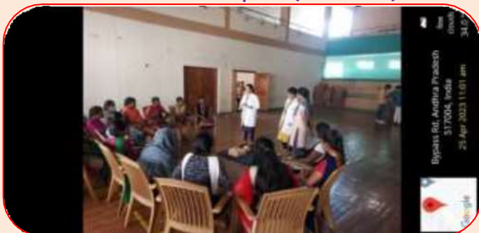
CPR Programme in association with Apollo Medical College (24-4-2023)