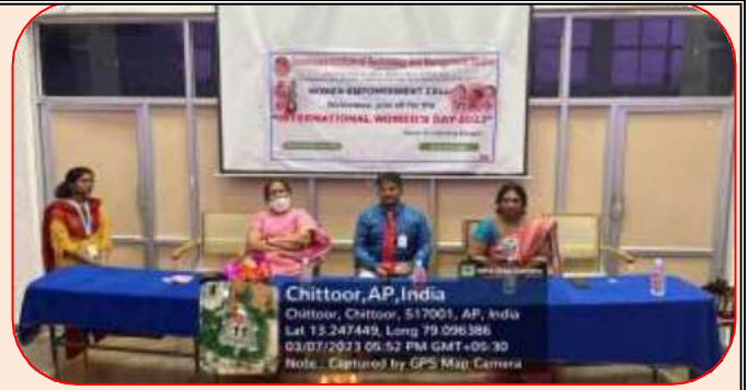
International Women's Day (08-03-2023)