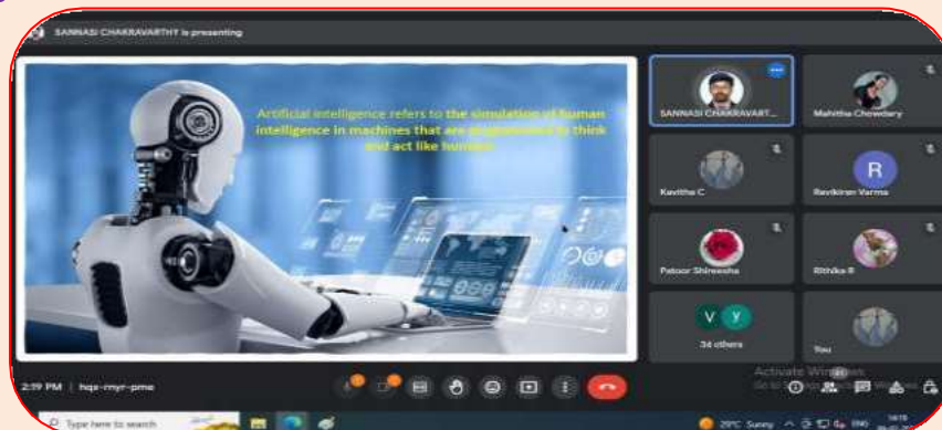
Work shop on "Research Strategies in Artificial Intelligence" (09-02-2023)