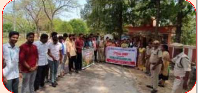
Special Camp (20-3-2023 TO 25-3-2023)