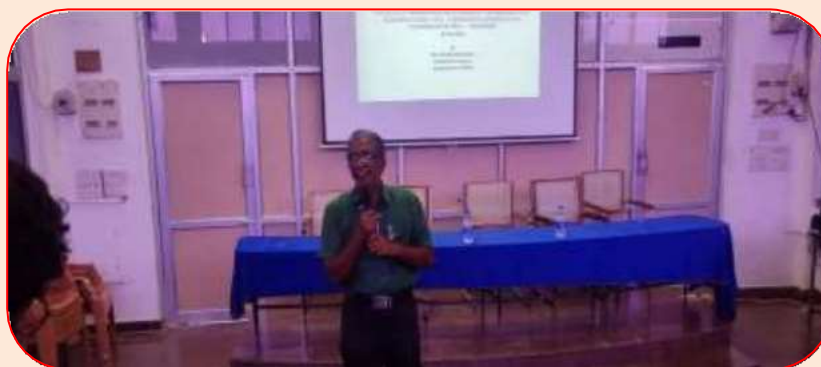
Expert Talk on "Process of Innovation Development, Technology Readiness 7thLevel(TRL);Commercilization of Lab Technologies & Tech-Transfer" (09-02-2023)