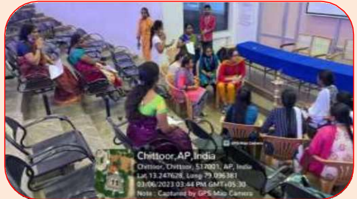
"STHREE- AN UN ENDING STRUGGLE" (07-03-2023)