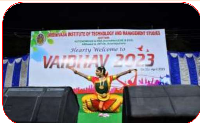
VAIBHAV-2023(Annual Day) (21-04-2023)