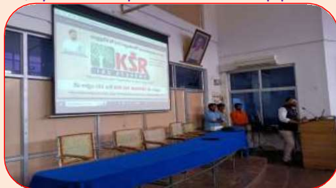
Awareness Program on "Dreaming IAS - The Path to Achieve it" (28-03-2023)