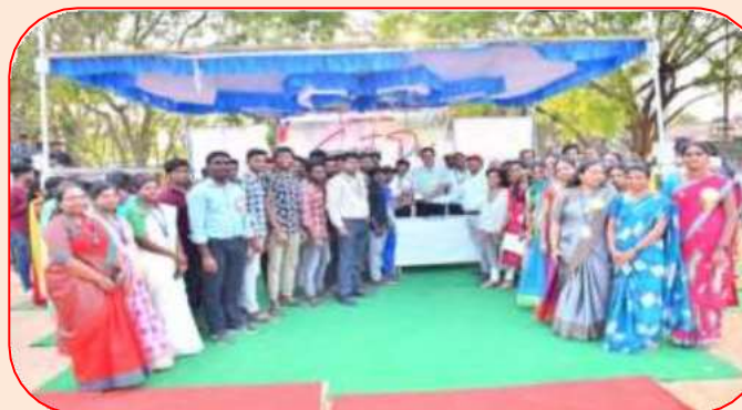
Sports day (20-04-2023)