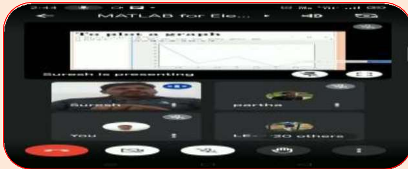
Webinar on "MATLAB for Electrical Engineering Applications" (07-02-2023)