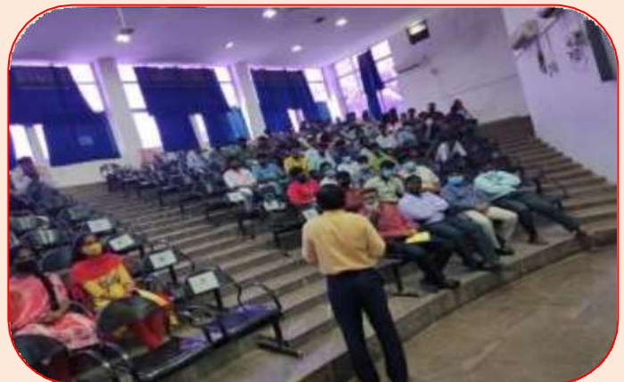
2nd International Conference on Advances and Innovation in Engineering and Sciences(ICAIES-2023) (12-04-2023 & 13-04-2023)