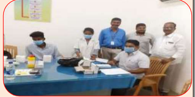
National Vaccination Day (16-03-2023)